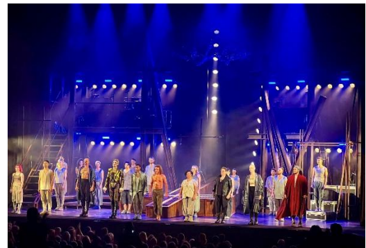
Jesus Christ Superstar!