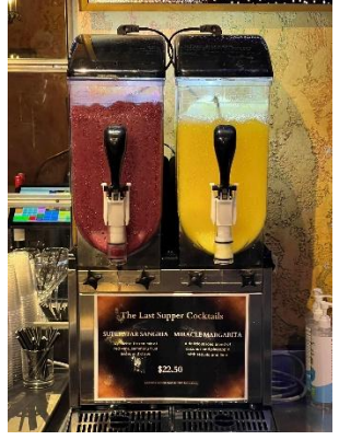
A little "theatrical" sustenance before......