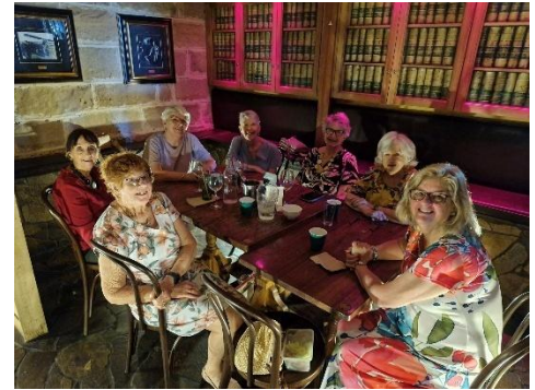
The Krafty ladies looking all dark and mysterious.