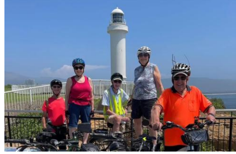
Our team for the 2025 Masters "The Saddle Sores"!