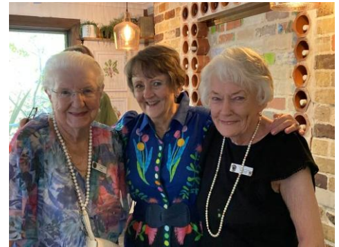
Three Christmas roses!