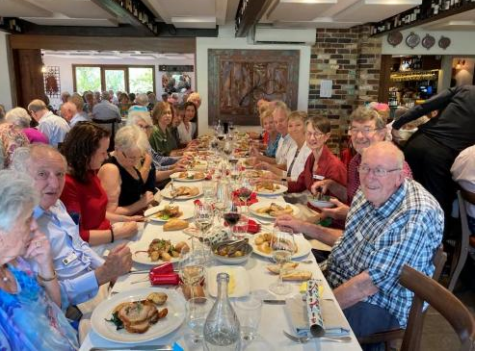
Well, we filled the restaurant and ourselves!