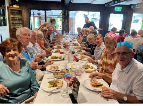
Please Sir, I want some more!