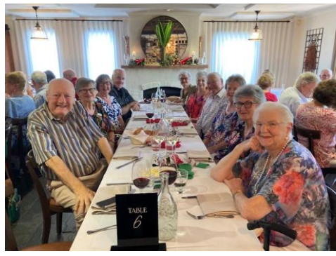
"Table 6" - THE place to be seen!